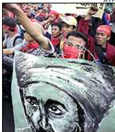
Anti-US demonstrations are gathering pace

The statement condemned the recent suicide attacks, but criticised the arrogance of US plans to retaliate against Afghanistan.