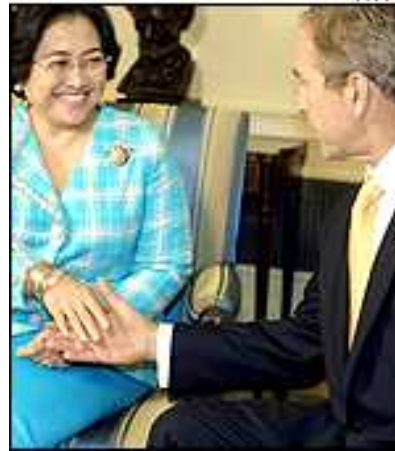
The clerics have warned Megawati against supporting Bush

But if large numbers of ordinary Muslims take to the streets in response to a call from the Council of Ulemas, the situation could become much more volatile.